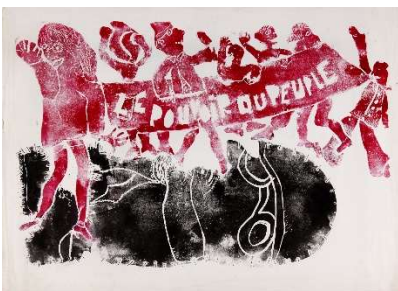
Jacqueline de Jong, Le pouvoir au peuple , 1968, linocut on paper, 60 x 78 cm, courtesy of Pippy Houldsworth Gallery, London, Photo: Gert-Jan van Rooij