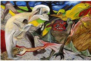
Jacqueline de Jong, Chemin Perdu de la Chasse Frustrée , 1987, oil on canvas, 190 x 290 cm, private collection, London, courtesy of Pippy Houldsworth Gallery, London, Photo: Gert-Jan van Rooij