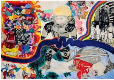
Jacqueline de Jong, Tourneviecioux Cosmonautique ou (les âmes les plus confuses se matin conditioner par un peu de pésanteur), 1966, acrylic on canvas, 114 x 162 cm, private collection, Amsterdam, Photo: Sylvie Léonard - Les Abattoirs, Toulouse