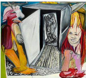
Jacqueline de Jong, Tureluurs, 2020, Oil and nepheline gel on canvas, 195 x 223 cm