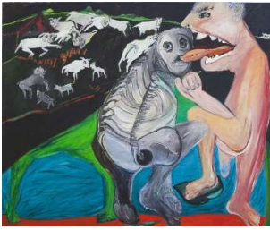
Jacqueline de Jong, The Ultimate Kiss , 2002–12, oil on canvas, 165 x 195 cm