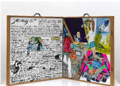
Jacqueline de Jong, The pain is beautiful , 1971, acrylic on canvas on wood, 54 x 102 cm (opened), private collection, Paris