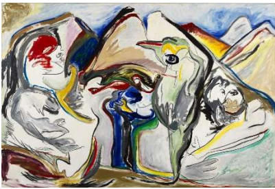
Jacqueline de Jong, Le jour des Montagnes philoSophiques , 1984, oil on canvas, 200 x 300 cm, private collection, Brandwijk, Photo: Gert-Jan van Rooij